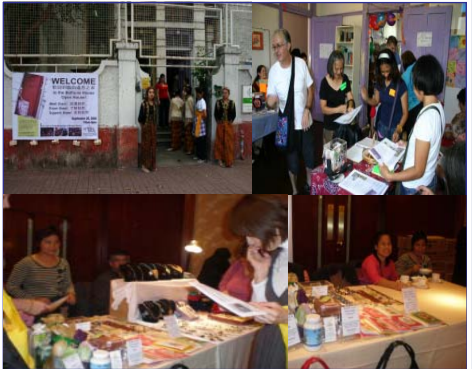
The Bethune House successfully held fund-raising initiatives as friends showed their support to the events and the cause.

The Bethune House table was able to offer something unique to the fair with their hand made cross-stitched Christmas cards, bottles of virgin coconut oil, organic coffee from the Philippines, and pieces of jewelry. Raffle tickets for the programs and services of the Mission for Migrant Workers, who helped establish Bethune House in 1986