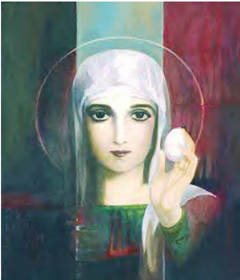
Mary Magdala, or Magdalene to many, was one of those women who accompanied Jesus. She was said to have devoted her life to the faith and the one who allegedly washed Jesus’ feet with her hair. She saw him on the cross and in the tomb and the first to witness his resurrection.

MOST SOCIETIES ASSUME that the roles played by men and women are “obvious” or that the ways in which males and females operate in society are established in nature rather than in culture. These conventional arrangements are the product of a society’s worldview. The Bible, revered by many as the written Word of God, does reflect the prevailing cultural norms, conventions and beliefs of the times with regard to women; hence, the Bible was (mis)used to oppress women.