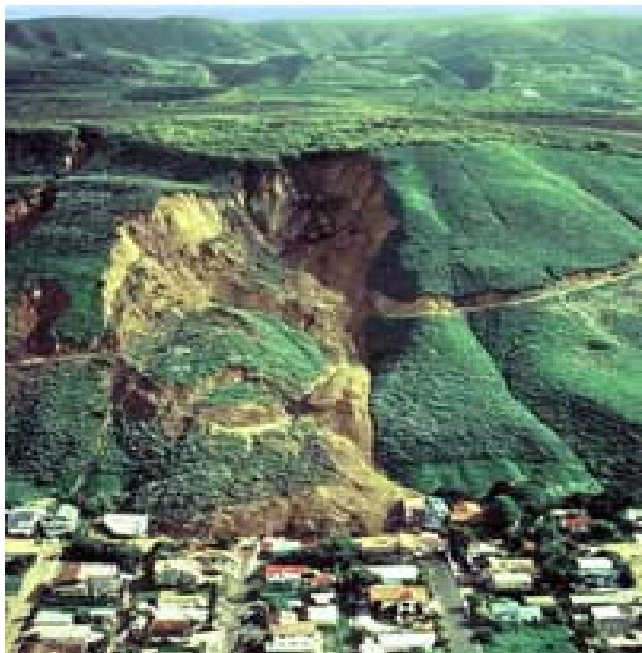
A whole barangay (small community) in Guinsaugon, Leyte was covered with mudflow after the uneventful landslide last February 2006.

IT HAS BEEN THREE WEEKS since the town of Saint Bernard, Southern Leyte was hit by a massive landslide. The Guinsaugon City was the most affected, where a whole barangay was covered by mudflow. Up to 3,000 people are missing while 1,400 are feared killed including some 200 schoolchildren trapped under the mud.